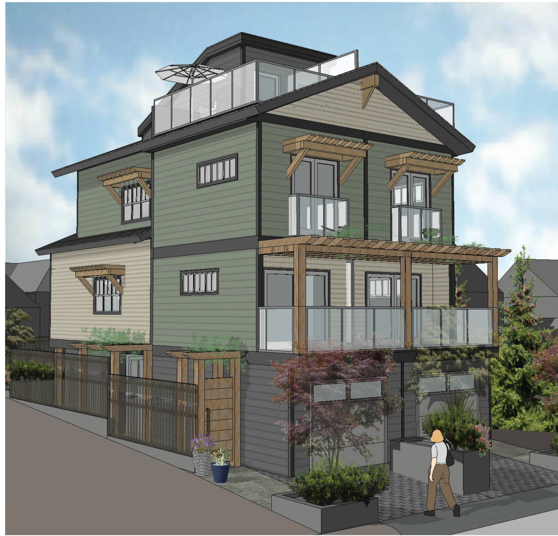
PERSPECTIVE FRONT VIEW FROM LANE (WEST)