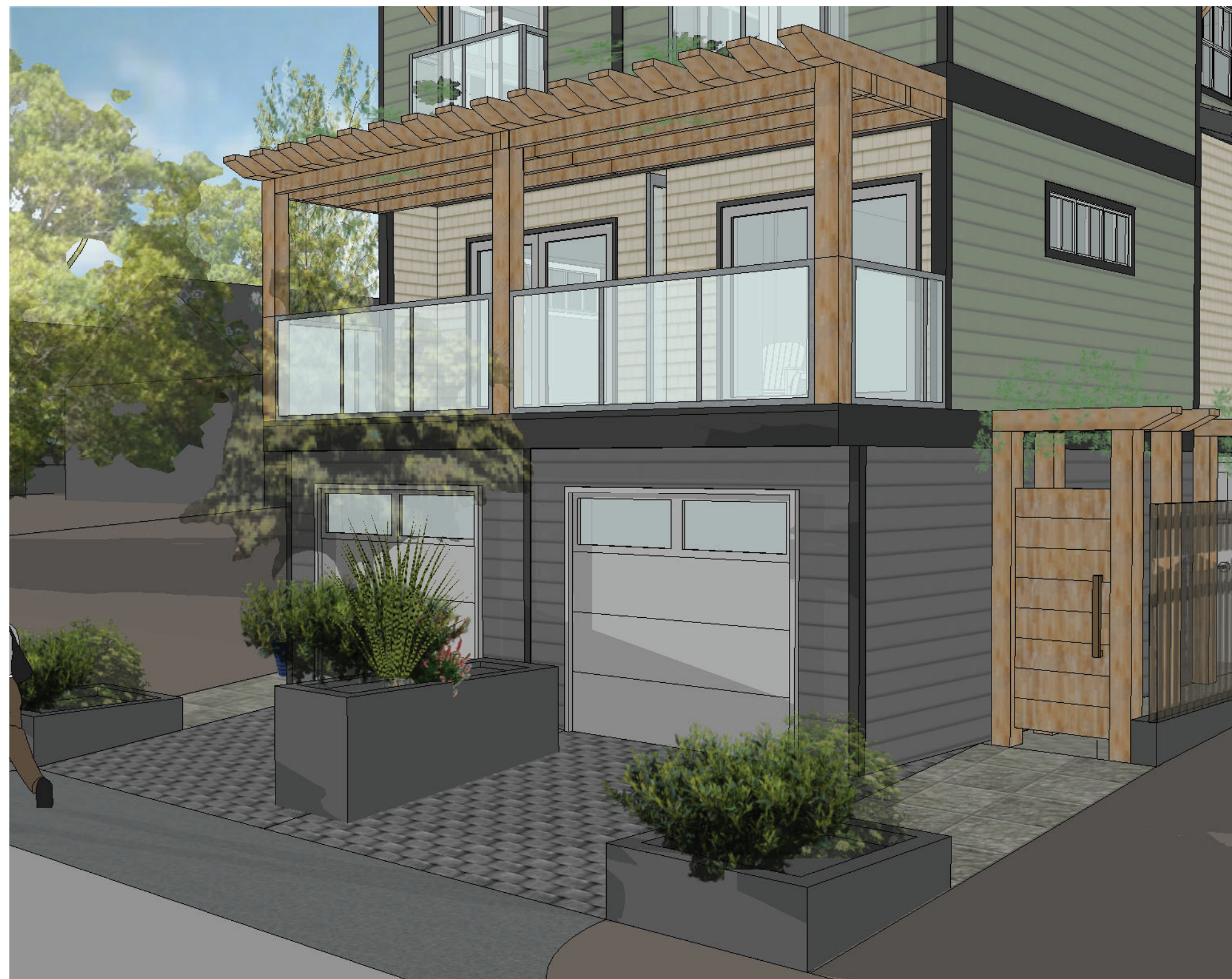
PERSPECTIVE VIEW OF ENTRANCE