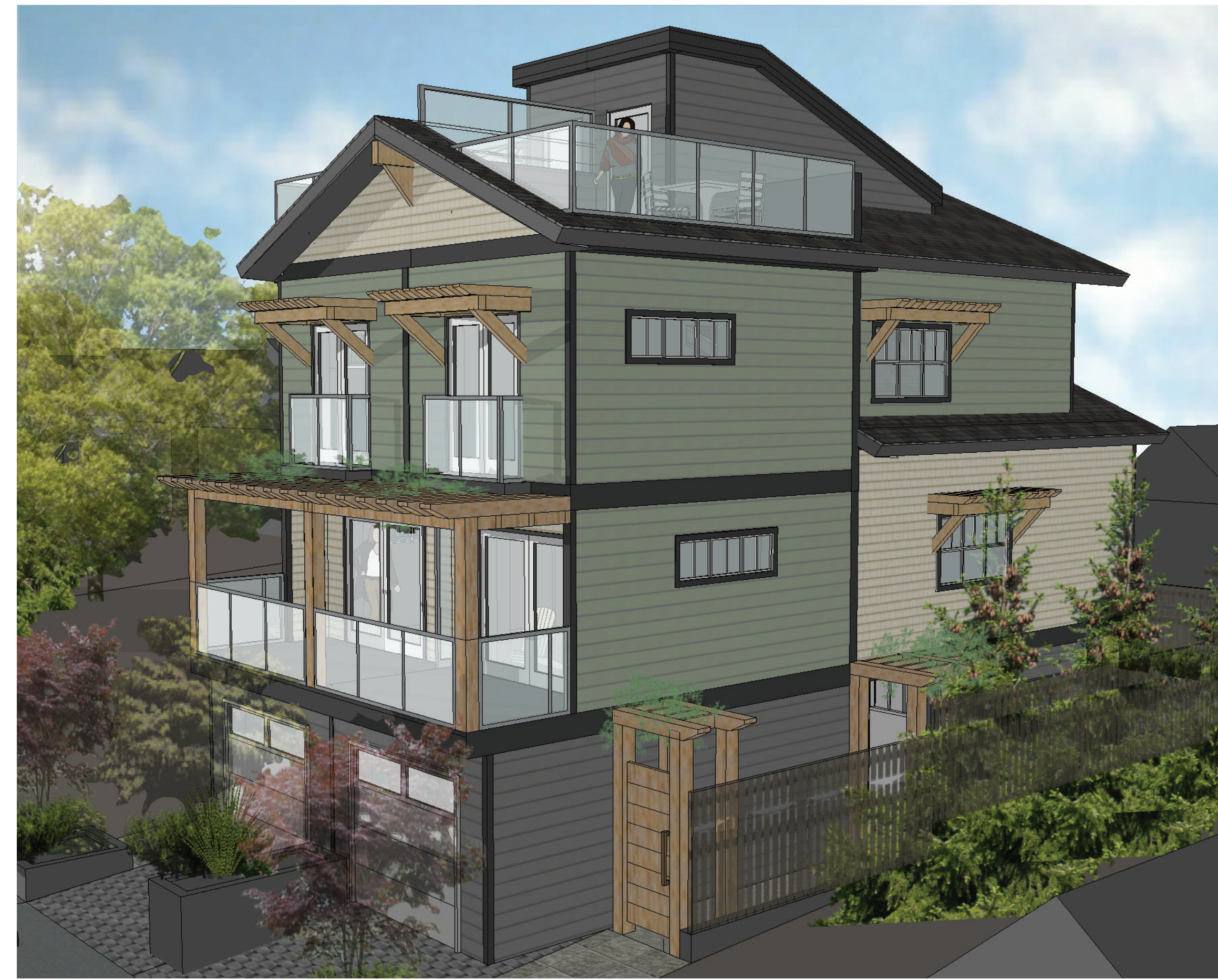
PERSPECTIVE FRONT VIEW FROM LANE (EAST)